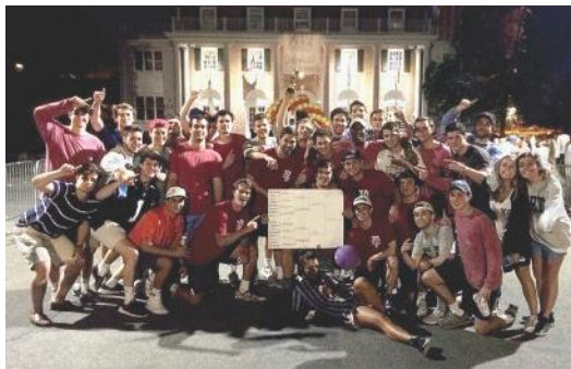
Chi Phi poses after winning the annual Chi Omega dodgeball tournament.