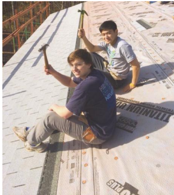
Brothers shingling the roof of a house for Habitat for Humanity

Thanks in part to these tough lessons, the chapter is thriving today. Here are just a few statistics to prove it: